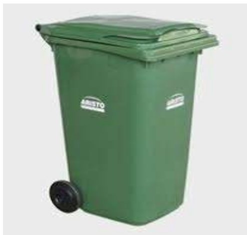
PIC – 1