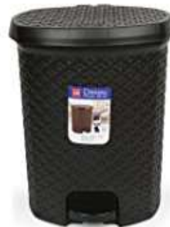
PIC – 2